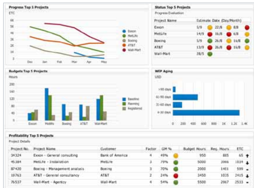
The pre-configured, best practice dashboards provide business users with a simple visual overview of their business area.

Preconfigured dashboards can be deployed immediately, or easily modified to meet the diverse needs of users across departments or locations, at all levels of the organization.